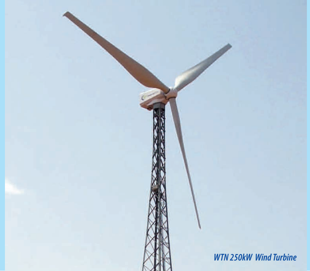
WTN 250kW Wind Turbine

WTN Wind Turbines are of strong robust construction and are designed for trouble-free operation. Fitted with the latest in advanced technology, their turbines will maximize your investment in green energy. There is in-built protection against high wind, and the manufacturer's dedication to superior quality ensures a long operating life for these turbines.